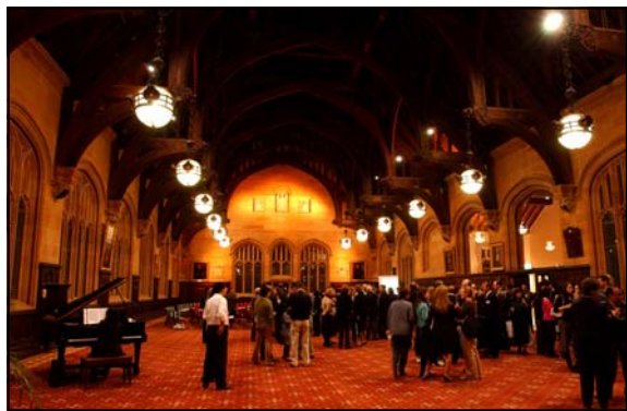
Faculty Awards Night, MacLaurin Hall.