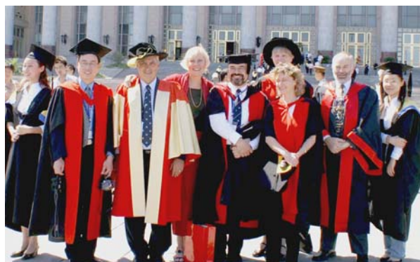
Photo: Staff from the College of Health Sciences in front of the Great Hall of the People, Beijing

Although Australia does not promote its educational expertise in China to the same extent as the UK and the USA, the University of Sydney is well known in China. The University of Sydney has placed a strong emphasis on internationalisation, and China is one of its top priorities. The Presentation Ceremony held on 2 September 2005 was the first time an overseas university was allowed to use the Great Hall of the People (the top government venue in China) for such a function, which indicated the University's determination to enter China with a big impact. The post-graduation dinners in the Beijing Hotel, featuring Australian wines courtesy of the Chancellor, Vice Chancellor and 50 other senior staff members, increased the realisation of the Sydney alumni of how much they missed their time at the Sydney campus, and certainly strengthened the friendships with various Chinese ministers and university presidents.