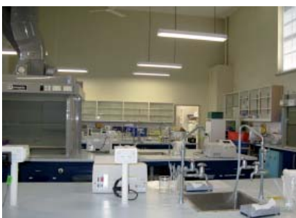
Crystal X-ray Diffractometer with funding from the Faculty of Pharmacy, Faculty of Science,

New state-of-the-art wet laboratories will ensure that the Faculty continues to provide first-class teaching to the next generation of pharmacy graduates. Minor works remain to be completed but most staff have moved into new office accommodation and research laboratories.