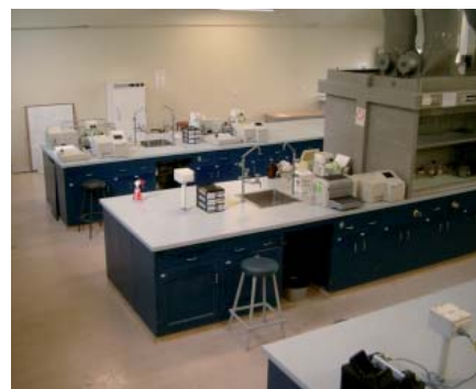
Pharmaceutical Sciences laboratory after the 5S training session.